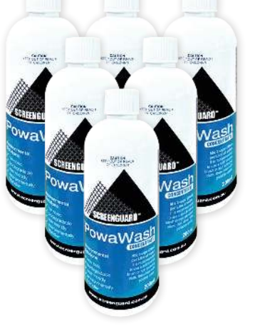
200ml per bottle